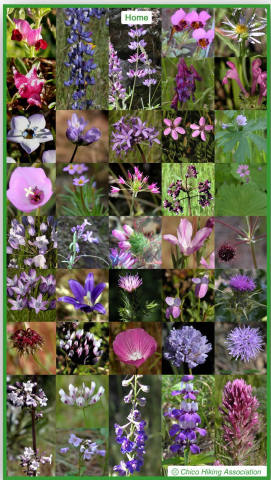
see our flower guide