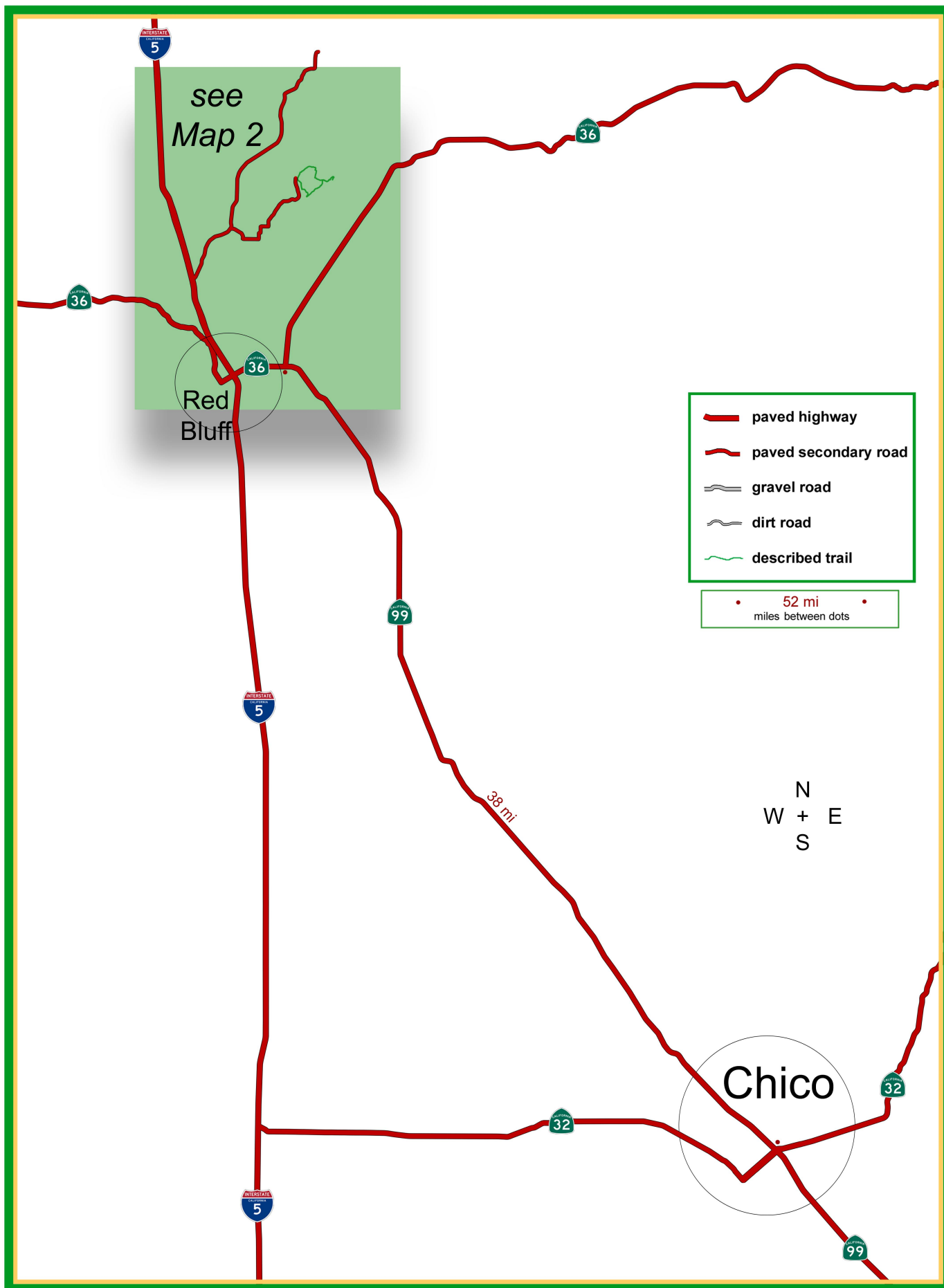
Paynes Creek Point semi-loop ▪ Map 1 of 3

Drive: 1:00 Hike: EASY Season: Nov-Apr (hot May-Oct)