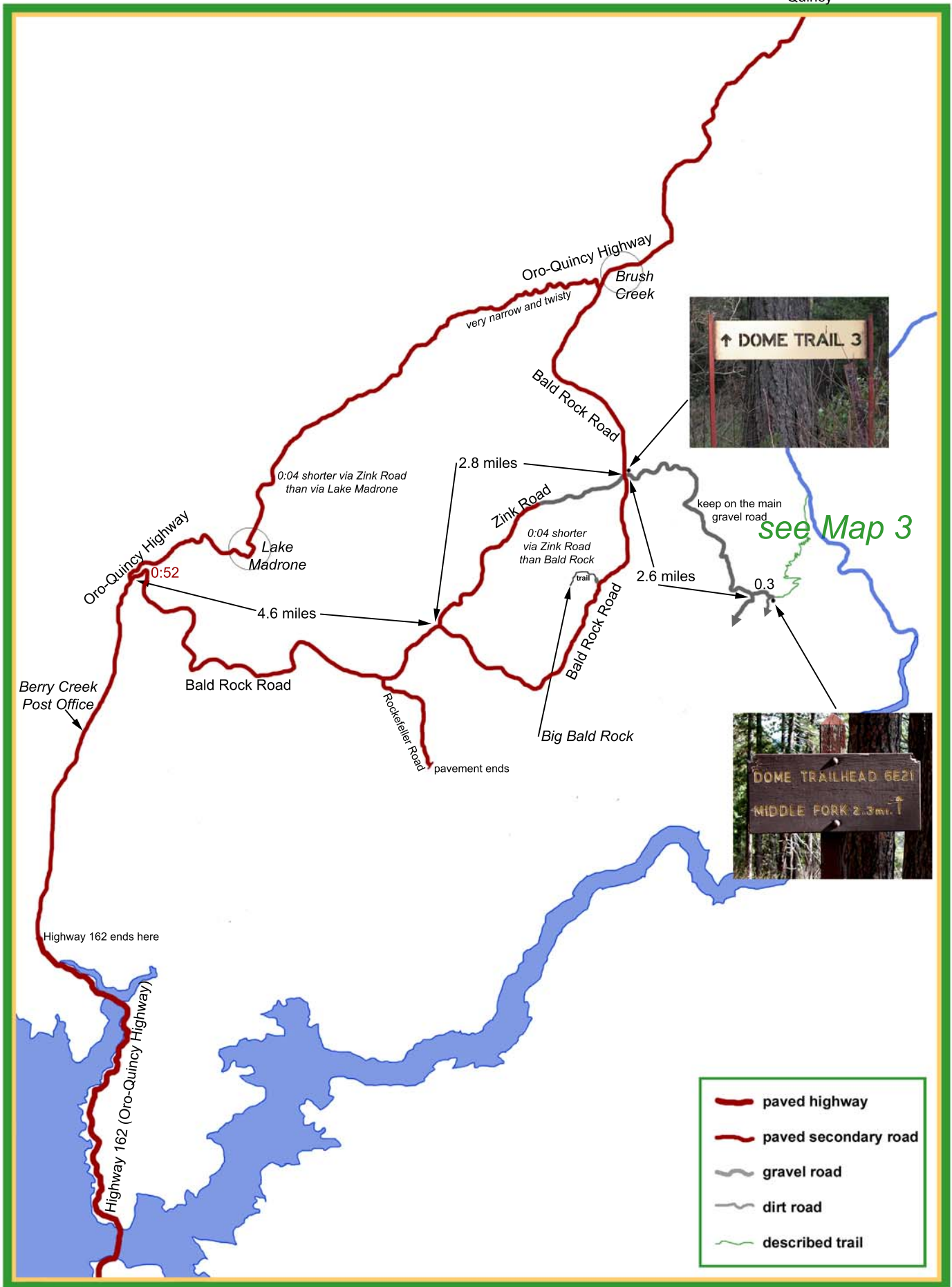
Dome Trail down-and-back ▪ Map 2 of 3