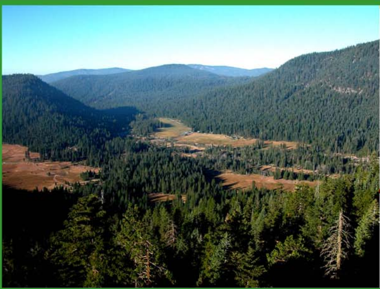
Childs Meadows from above

Drive: 1:15 Hike: CHALLENGING Season: Aug-Oct (mosquitos in July, snow Nov-June)