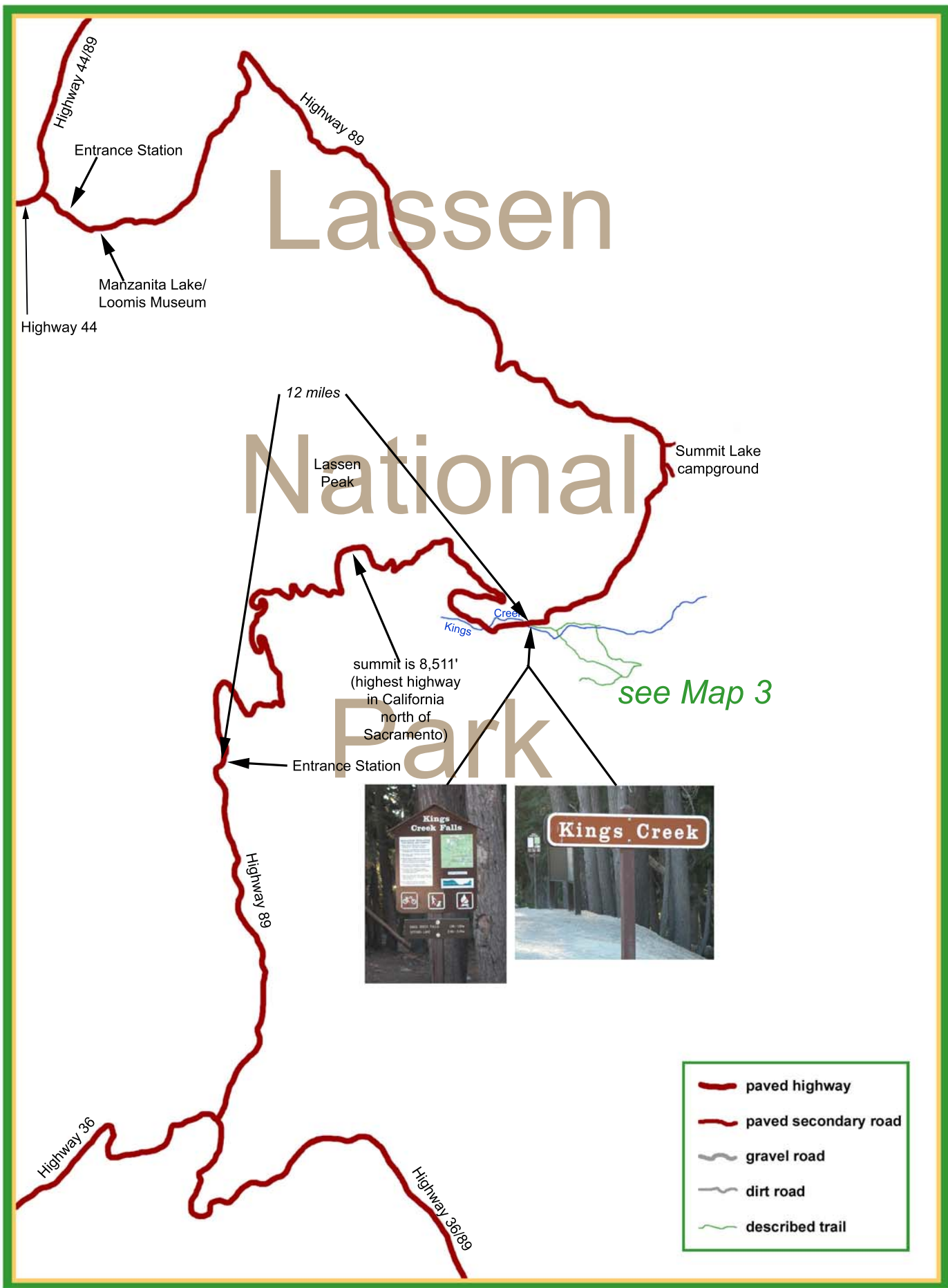
Sifford Lakes semi-loop ▪ Map 2 of 3