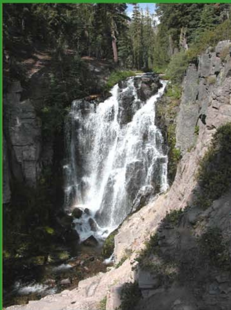
Kings Creek Falls

Drive: 1:55 Hike: EASY Season: Aug-Oct (mosquitos in July, snow Nov-June)