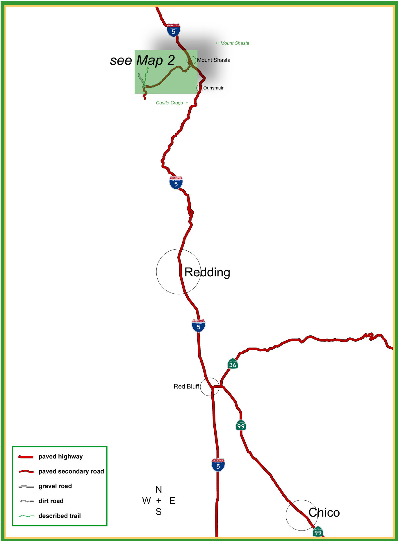
Toad Lake in-and-back ▪ Map 1 of 3

Drive: 2:40 Hike: OVERNIGHT BACKPACK Season: mid June-Sept (snow Nov-June)(nights long in Oct)