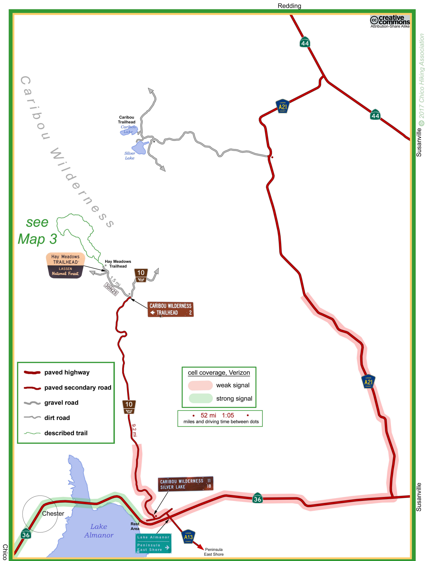
Posey Lake loop ▪ Map 2 of 3